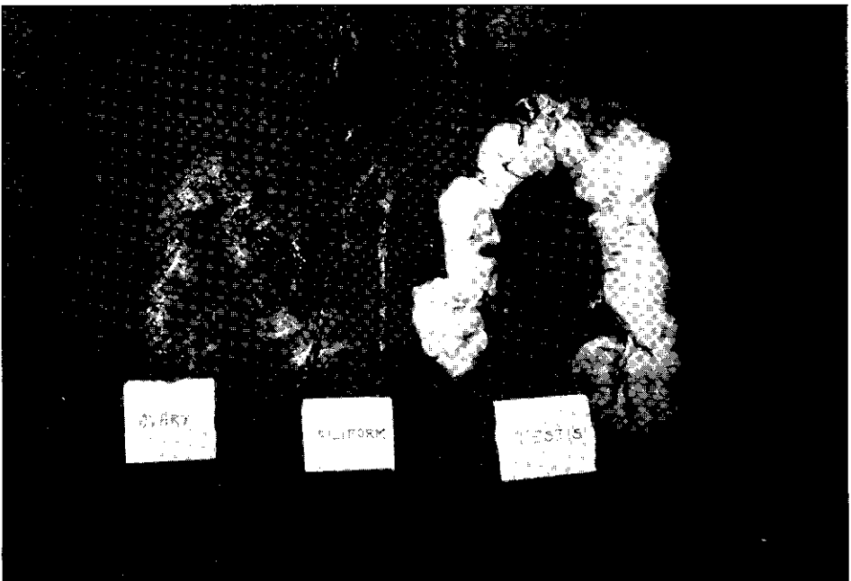
Fig. 3. Photograph showing the exposed gonads. Note the small, thin, filiform sterile gonad of NE-treated fish (center) and the large well-developed ovary (left) and testis (right) of control fish.