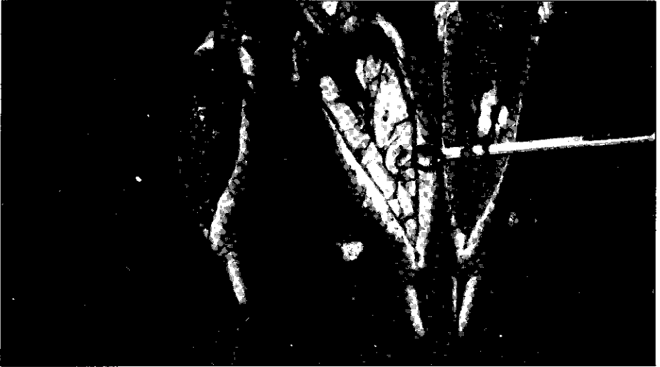
Fig. 2. Photograph showing ovary (left) and testis (center) in control fish, and the filiform gonad (right) in NE-treated sterile fish. Note the thin, thread-like gonad lifted with a spatula in NE-treated carp. Note also the thick musculature in the abdomen in sterile fish, the testis and ovary occupying the entire abdominal cavity, and the thin, sagging musculature clearly discernible in normal fish.

and 85% were mature. In sterile fish, the development of gonads was almost completely suppressed and they were represented by thread-like (filiform) strands (Figs. 2 and 3). Administration of NE at 5 \text{ mg}\cdot\text{kg}^{-1} slightly suppressed the testes and significantly suppressed ovaries, as indicated by the GSI values (Table 2).