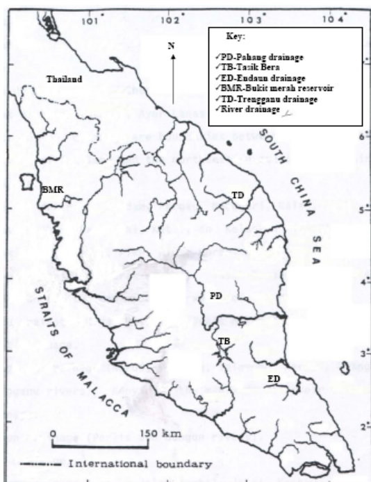
Fig. 1. Major river drainages and major habitats of arowana ( Scleropages formosus ) in Peninsular Malaysia

The presence of the Asian arowana ( Scleropages formosus ) has been reported in Borneo, Cambodia, Malaysia, Sumatra and Thailand (Pouyaud et al. 2003). Previous studies have reported the presence of cross-back golden variety in the Pahang and Johor States while the blue-base variety was found in Bukit Merah, Perak (Zakaria-Ismail 1987; Pouyaud et al. 2003). It is believed that the wild populations of the golden variety are almost extirpated due to over collection and rapid habitat modification. The green variety however is still relatively common in areas such as Tasik Bera in Pahang, Endau River in Johor (Ng & Tan 1999; Sim 2002) and Terengganu drainage (Cramphorn 1983)(Fig. 1).