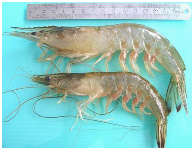
Fig.1. New variety of F. chinensis "Huanghai No.1". (top: ♀, bottom: ♂)